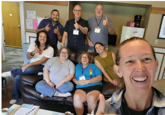
Here we are in our small group at Waycross, all smiles.